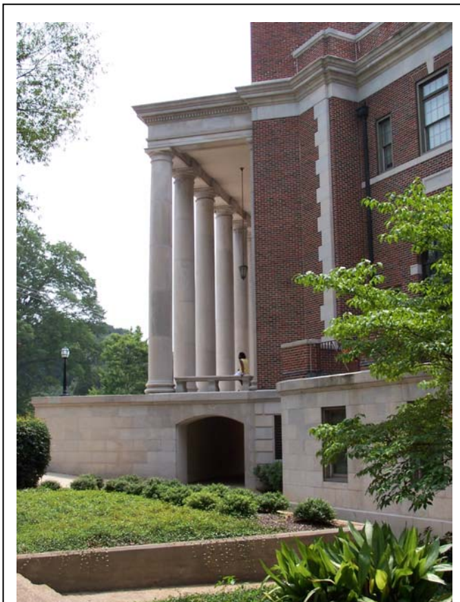
Reese Phifer Hall

Students from five majors (first major) represented the college.