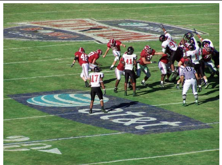
The winning kick in the 2006 Cotton Bowl.

515 I was blessed to receive an education in several areas. The College of Human Environmental Sciences makes sure that you receive training not only in your major, but also for your life. The required course, HES 300, covers resume writing, interview skills, etiquette, etc. I also had the opportunity to earn a minor in a completely different area than my major. My other core classes and electives allowed me to receive a very well-rounded education.