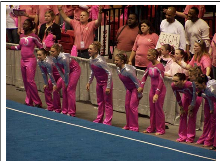
The gymnastics team cheers on a teammate in front of a SEC record crowd of 15,162.