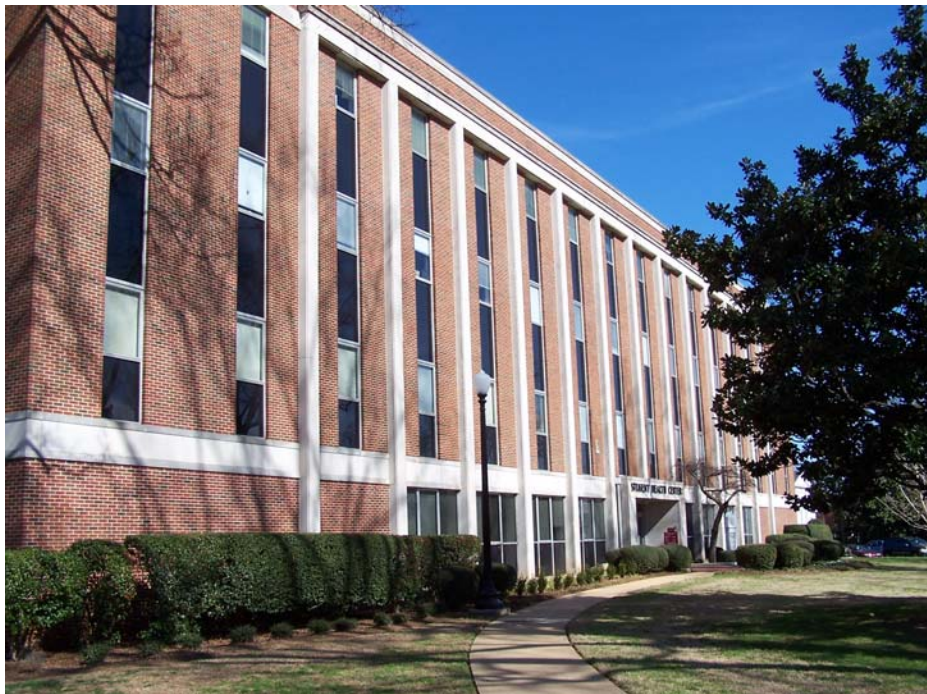
Russell Student Health Center

Forty-three of 107 graduating students (40.2%) from the Capstone College of Nursing completed the instrument during the 2005-06 academic year. Nearly all of the respondents were female (93.0%). Thirty-nine of the students were white (90.7%), three were African-American (7.0%), and one was Native-American (2.3%). Five respondents graduated during the summer 2005 term, eight in the fall 2005 term, and 30 in the spring 2006 term.