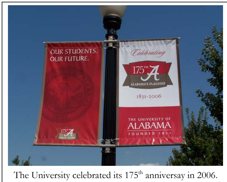
The University celebrated its 175 th anniversary in 2006.

to open-ended questions are listed and highlighted in red italic text . An ID number is provided each student to allow comparisons and context among their open-ended responses. For example, all open-ended responses for each number are given by the same graduating student. The number of respondents (N) for each structured item and those providing open-ended comments is given as well.