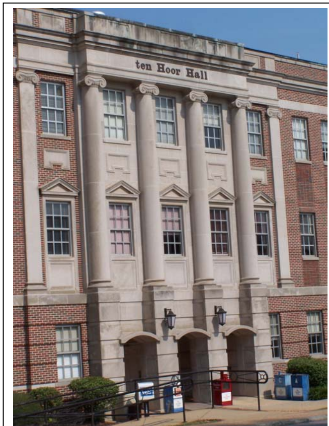
ten Hoor Hall

Students from thirty majors (first major) represented the college.